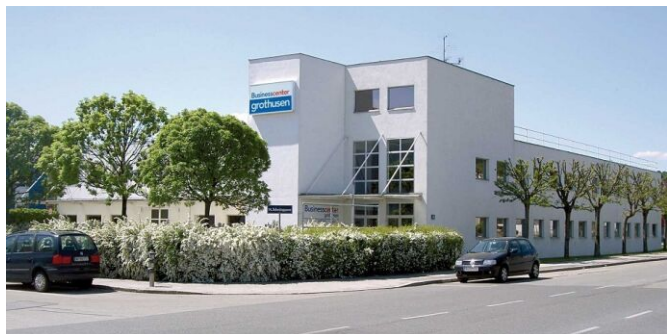
Business Center Grothausen